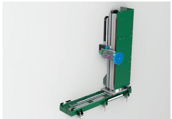
Planar Near-Field Scanner: front view